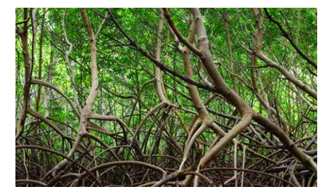
Red mangroves in Guadeloupe

To follow the progress of Mang, a project supported by AFD, check the website: PROGRAMME MANG