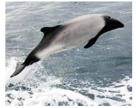
The Commerson's dolphin

he Commerson's dolphin (Cephalorhynchus commersonii), commonly known as panda or skunk dolphin, is one of the most unique species in the world in terms of distribution. While the majority of the population is found in the austral waters of South America and the Falkland Islands, another population was identified in the 1950s around the Kerauelen Islands (French Southern Territories -Southern Indian Ocean)