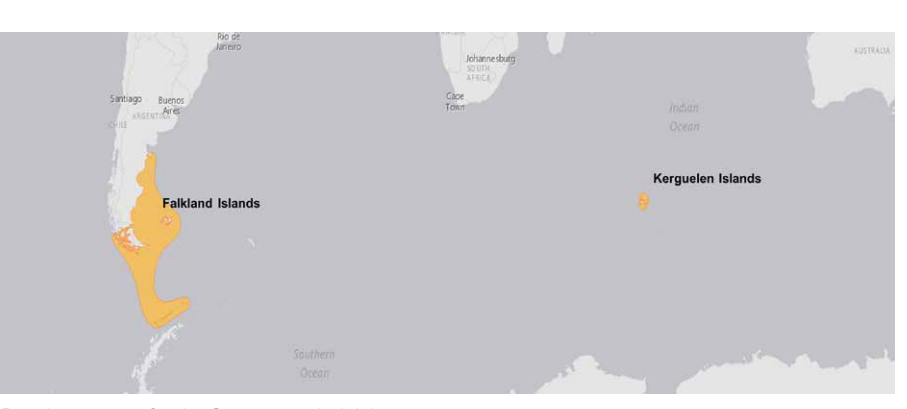
Distribution map for the Commerson's dolphin

This geographical separation of more than 7,000 km is accompanied by a marked genetic divergence, leading scientists to recognize them as two distinct subspecies (in 2007), one endemic to the waters around the Kerguelen Islands. The species lives in shallow, coastal waters (fjord type of habitat) which increases the risk of incidental capture in fishing nets - as seen in Argentina for example – and has very low population numbers, making it particularly vulnerable to the effects of climate change on the availability of its prey. While the species is currently listed as data deficient (DD) on the Global IUCN Red List, the subspecies endemic to the Kerguelen Islands was recently ranked as endangered (EN) on the Regional Red List of French Southern and Antarctic Lands (TAAF).