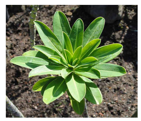
Euphorbia stygiana (Botanical specimen in the Botanischer Garten, Frankfurt am Main)

Europe's overseas territories and shows the value of the BEST teams' work with the local biodiversity experts. Thanks to the review of species listing status done for the BEST regional strategies, the knowledge of EU overseas biodiversity experts, notably their expertize with endemic species, is contributing to the global listing process.