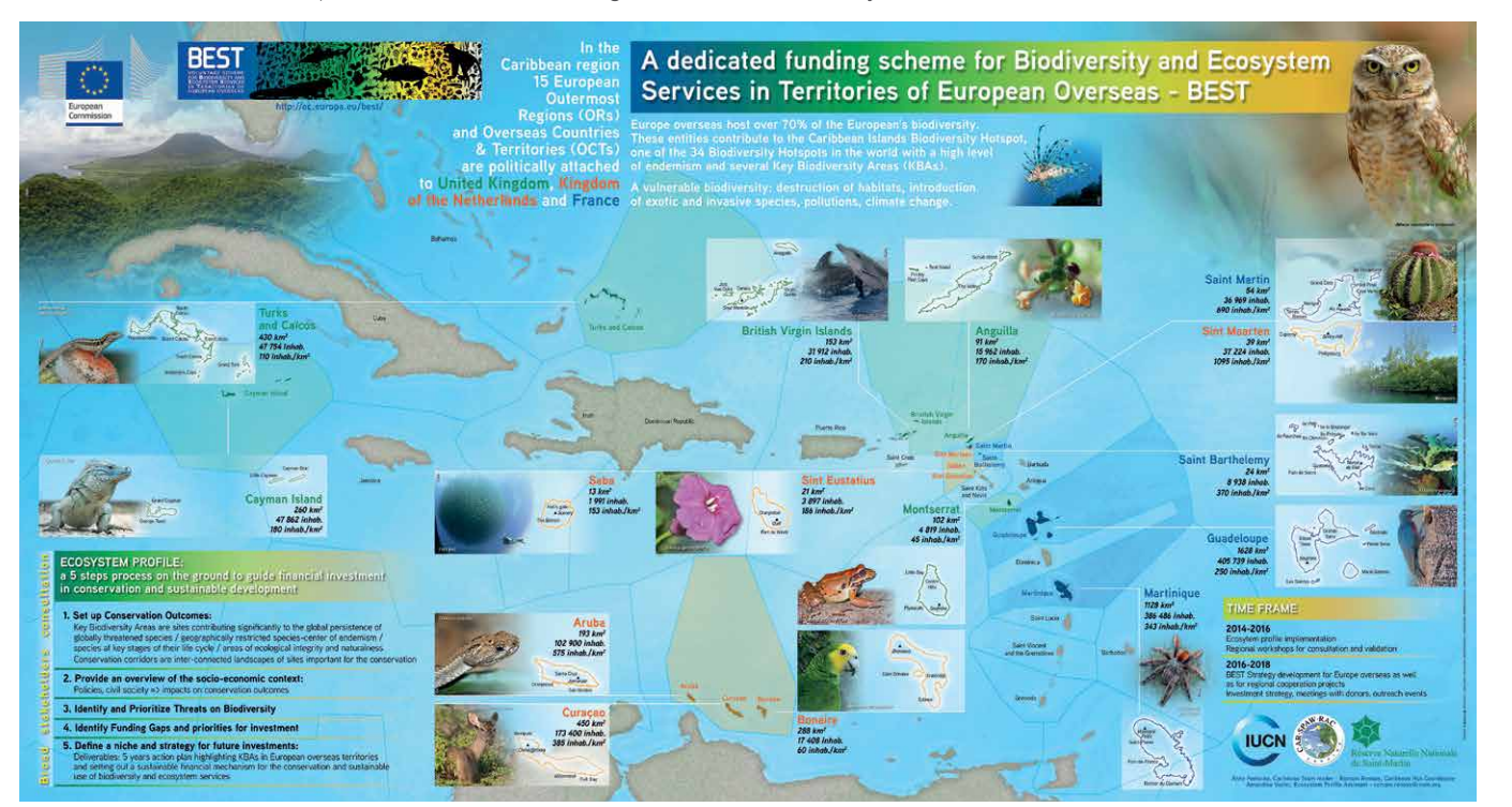
Poster BEST III Caribbean region

USEFUL LINKS Region's webpages Caribbean hub webpages