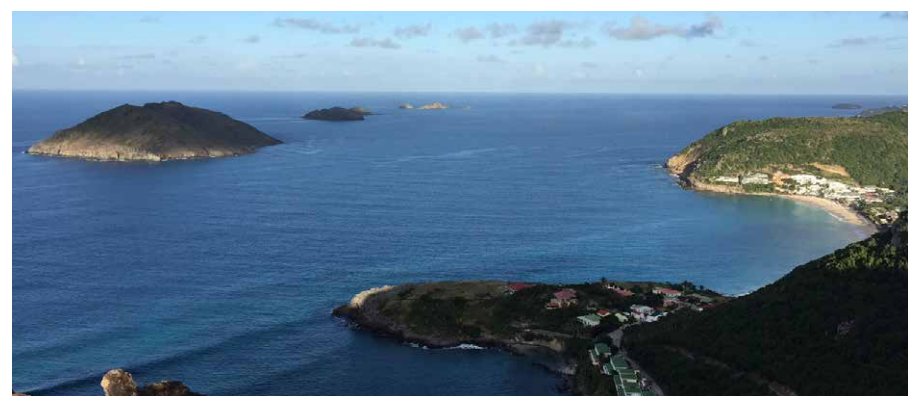
St Barthelemy islets

It is therefore across multiple borders, in several languages and with a variety of cultures and administrative systems that the Caribbean hub team of the BEST III Consortium is working. From a biodiversity perspective, the task seems daunting as well. Like the other regions where European Overseas entities are located, the Caribbean hosts an extraordinary biodiversity with a high rate of endemic species due to their insularity. Some figures speak for themselves: 11,000 native species of seed