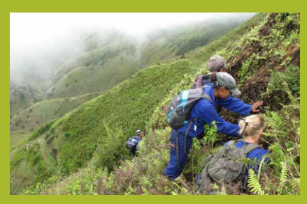
Botanists from the Conservation Department carry out a plant census

The UK Overseas Territory of Ascension Island is located almost half way between South America and Africa. Created around one million years ago from an underwater volcano along the Mid-Atlantic Ridge, it is a place of contrasts: from the barren volcanic landscape largely devoid of plant life around the coast, to the lush man-made cloud forest of Green Mountain. Ascension is geologically young and this, together with its isolation, results in its comparatively species-poor biodiversity. However, the degree of endemism is high, with at least 55 endemic species of plants, fish and invertebrates - terrestrial and marine. Ascension Island also supports the largest green turtle and seabird nesting colonies in the tropical South Atlantic.