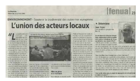
La Dépêche newspaper article on the meeting

This first meeting's objective was to bring together all the stakeholders involved in local conservation, to present BEST and start the consultation process - the base of the BEST III process.