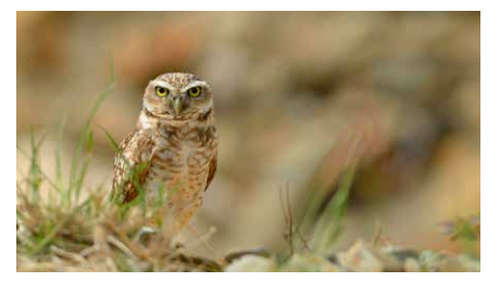
Aruban Burrowing Owl, Athene cunicularia

The Wider Caribbean includes 37 independent states and territories, including 15 territories and regions of the European Overseas: Guadeloupe, Martinique, St. Martin, St. Barthelemy are attached to France, Saba, St Eustatius, Sint Maarten, Bonaire, Curacao and Aruba are attached to the Netherlands, while Montserrat, Anguilla, the British Virgin Islands, Turks and Caicos and the Cayman Islands are attached to Britain.