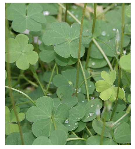
Marsilea azorica (Conservatoire botanique national de Brest, France).

The BEST regional hubs are definitively ideally placed to facilitate the communication between the Red List team and local researchers, and efforts are underway to facilitate Red List updates. Such facilitation process supports biodiversity conservation in