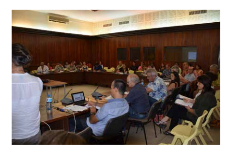
About 60 people attended, representing government, research institutions and civil society

During the follow-up discussions, representatives of the local associations voiced their support for the BEST 2.0 grant programme. They emphasized their need for and the benefit they will get from the coaching opportunities offered by the programme, specifically to develop project proposals.