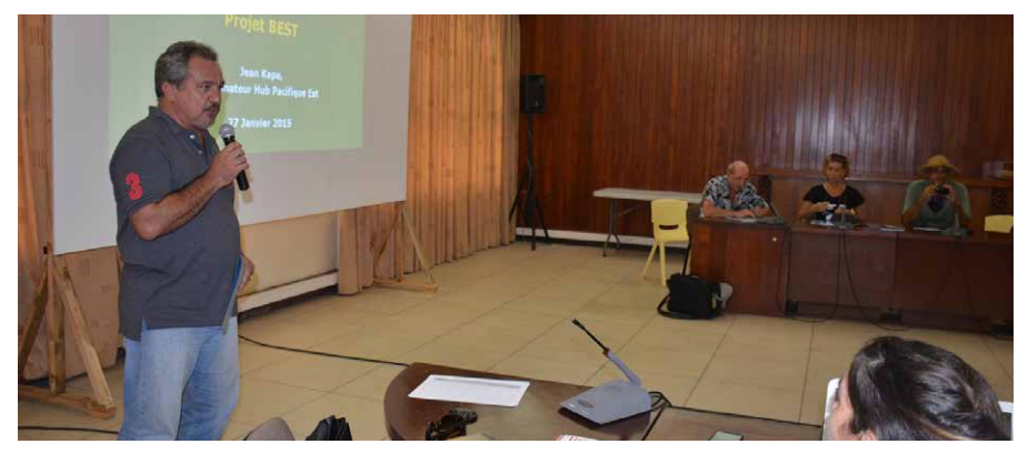
Opening speech by the Minister of the Environment for French Polynesia

The Minister of the environment, M. MAAMAATUAIAHUTAPU, officially opened the meeting with a speech welcoming the BEST III project. He invited attendees to participate in the development of the ecosystem profiles, stating 'The biodiversity of French Polynesia is the responsibility of all'.